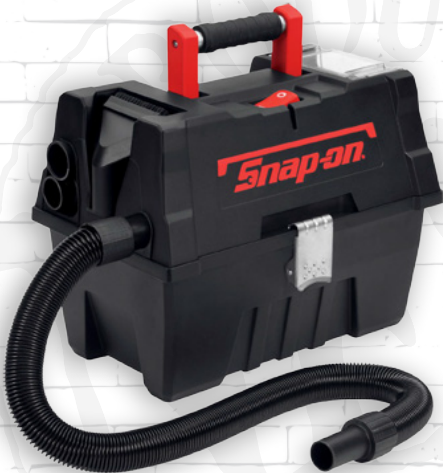
22Q1-CTVAC9050 18v CORDLESS VACUUM