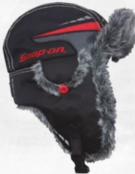
MEN'S BLACK TRAPPER | 22Q4-SN07-7808