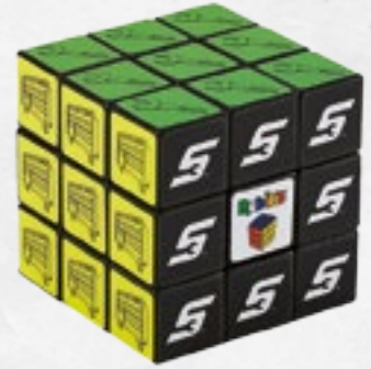
SNAP-ON RUBIKS CUBE | 22Q4-SSX21P130