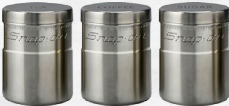
FDX SOCKET TEA/COFFEE/SUGAR SET | 22Q4-SSX22P1UK