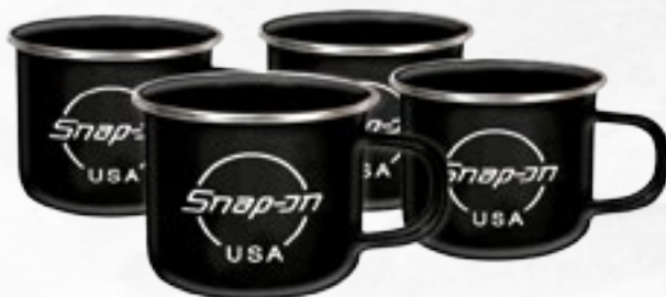
ENAMEL MUG SET - 4 PACK | 22Q4-SSX22P2UK