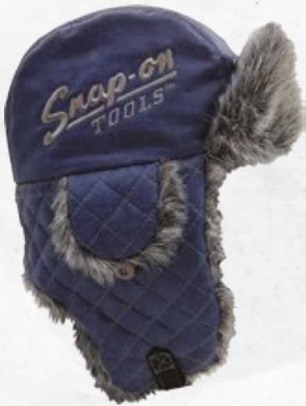
MEN'S BLUE TRAPPER | 22Q4-SN07-7807