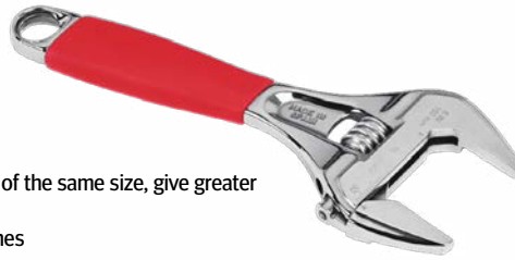
26Q2-DBT7 7 PC TORX® DOUBLE BALL L-SHAPED KEY SET (BLACK)