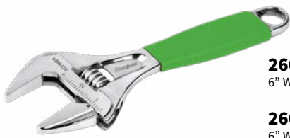
26Q2-ADHW6AG 6" WIDE MOUTH ADJUSTABLE WRENCH (GREEN)