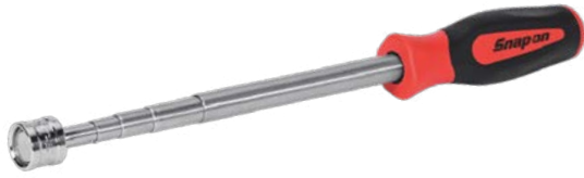
26Q2-PTM18 ■ 18 LB TELESCOPING MAGNETIC PICK-UP TOOL WITH INSTINCT® HANDLE (RED)