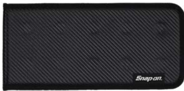
26Q2-MAGMATXL ■ HIGH-POWER MAGNETIC MAT (BLACK)