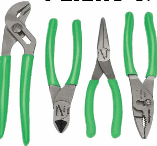
26Q2-PL400BG 4 PC PLIERS/CUTTERS SET (GREEN)