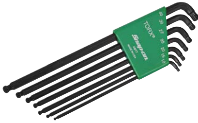
26Q2-CW15A 19" CHAIN 15" HANDLE CHAIN WRENCH (BLUE-POINT®)