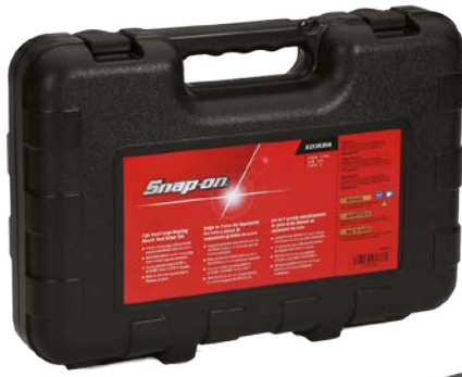
26Q2-A1310LHSB 7 PC STEEL LARGE BEARING AND SEAL DRIVER SET