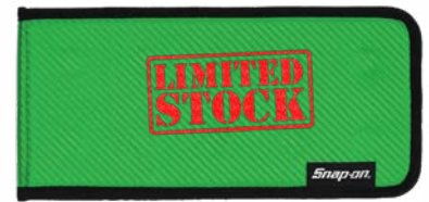
26Q2-MAGMATXLG ■ HIGH-POWER MAGNETIC MAT (GREEN)