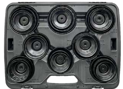
26Q2-OFSKIT 4 PC OIL/FUEL FILTER SOCKET SET